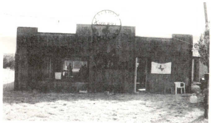
The Double Diamond Pavilion that has given a decade of service to our always successful, always enjoyable Field Day exercise every 4 th full weekend of June. Thanks to all that help make this happen for the BBARC.