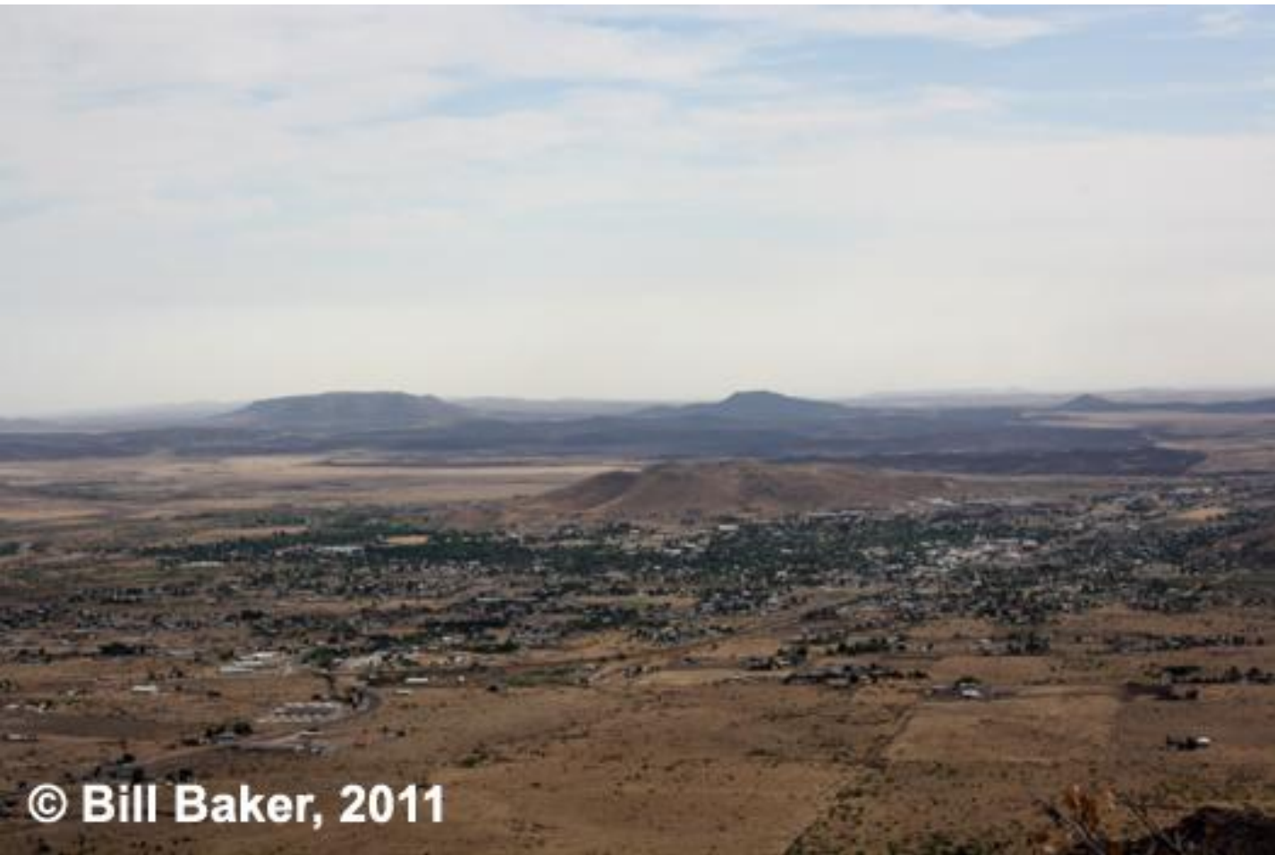
This last image is the view of Alpine from the 146.720 repeater site on Twin Sisters Peak.