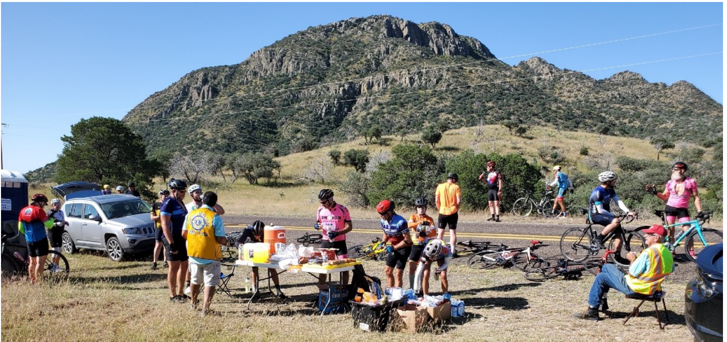
A typical aid station, from left to right, the bathroom, SAG wagon, refreshments and Lions Club volunteer, and the BBARC volunteer.

were out, adding another sensory variety. The mountain scenery is captivating.